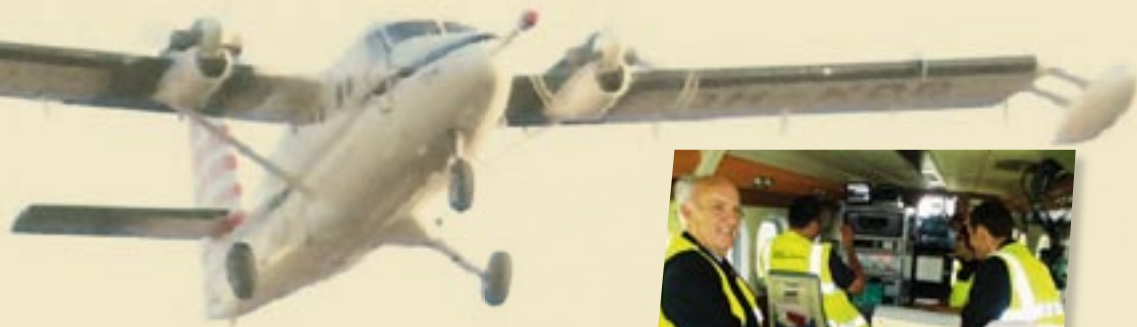
Airborne Geophysical Study of the Longford-Down Massif carried out with a DHC Twin-Otter with two magnetometers, 4 frequency EM and gamma-ray spectrometry. The survey was flown on a zoom line spacing at an altitude of 55m.