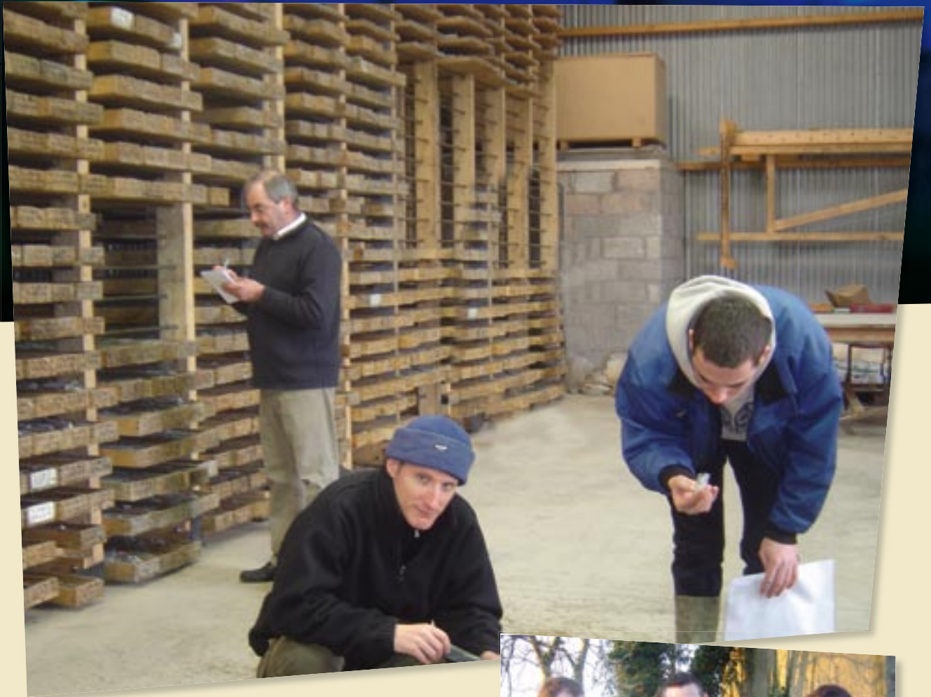
Working in Coreshed and out in the field in the Longford-Down Massif